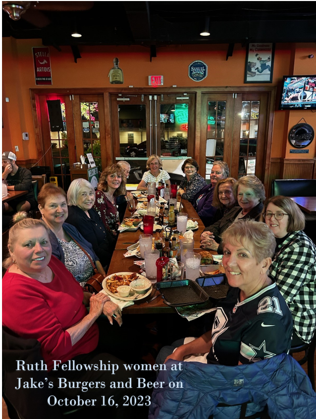
Ruth Fellowship women at Jake's Burgers and Beer on October 16, 2023